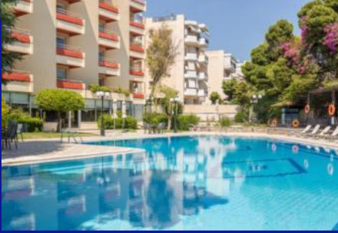
Limited rooms available at each hotel